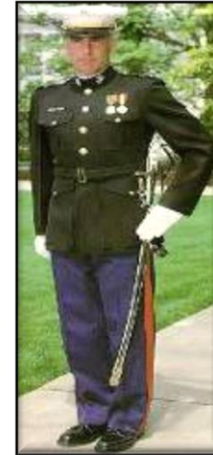
Class A Uniforms